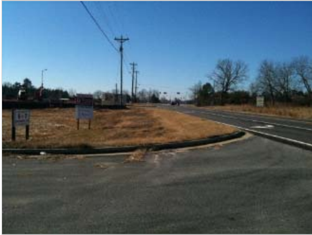
View down Hwy 81 S toward hwy 316