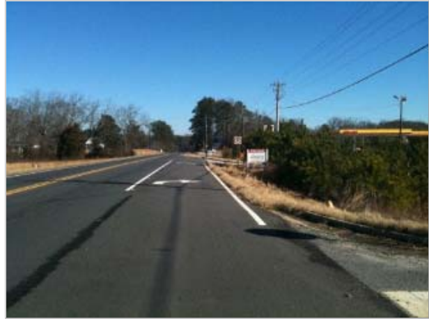
View N on Hwy 81 away from Hwy 316