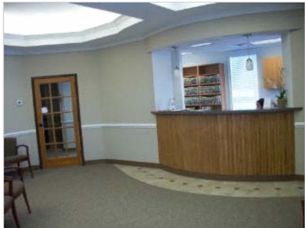
Typical Reception Area