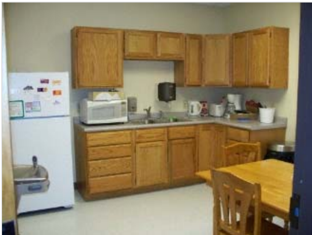
Typical Break Room