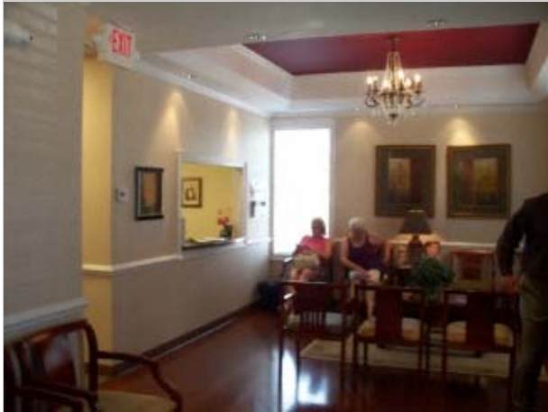
Typical Medical Reception