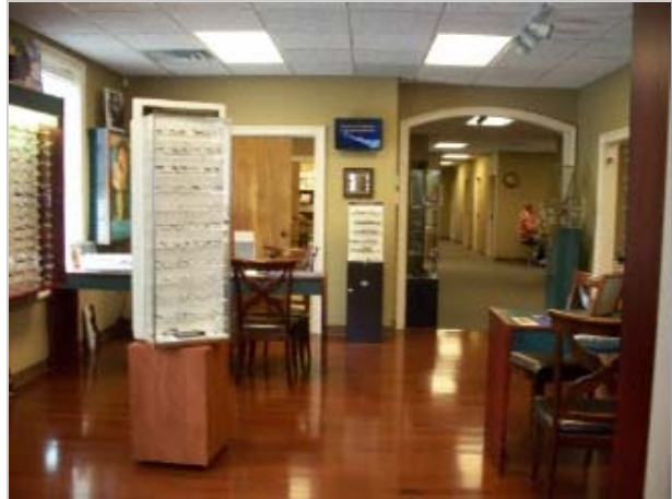
Typical Medical Interior